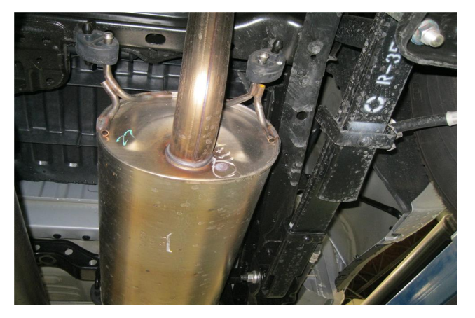
Step 2. Disengage hangers from rubber insulators and remove the OEM exhaust.

Step 1. Begin removal of the OEM exhaust system by unbolting the two spring loaded bolts attaching the exhaust to the catalytic converter. Do not discard or damage the OEM fasteners or rubber insulators as they will be used to install the new system.