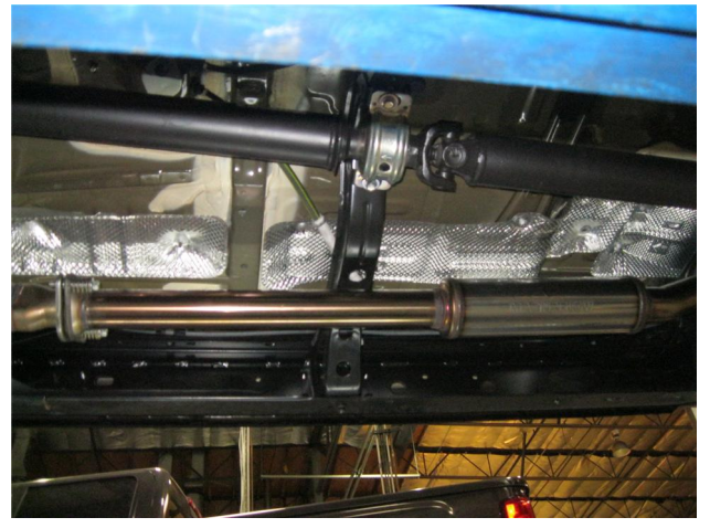
Step 3. Begin installation of your new MAGNAFLOW system by attaching the Inlet Pipe Assembly to the catalytic converter outlet using the OEM fasteners and insulator. Keep all fasteners and clamps loose until final adjustment.